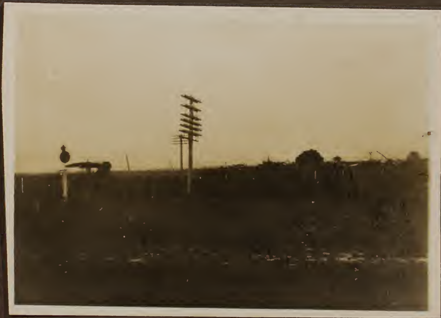
Sugar Train No. 1211 12 vii 28